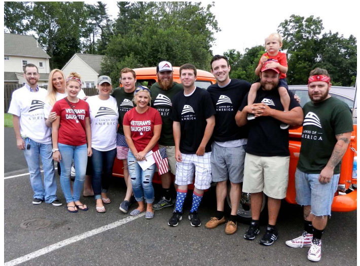
"Lawns Of America" organization assembling prior to parade. This organization will cut the lawns of veterans who are incapacitated free of charge