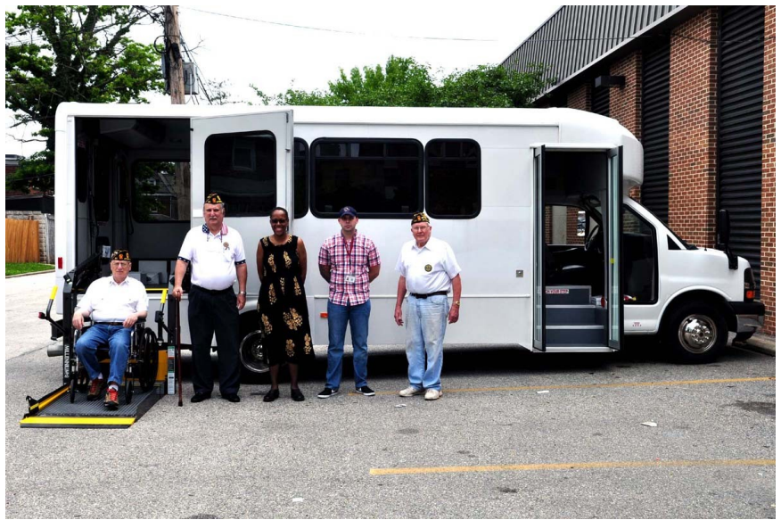
The Veteran's Van was dedicated outside the Montgomery Veterans Affairs Office on 18 June 2015. The purpose of this van is to transport veterans to Spring City, Coatesville and other locations for medical treatment.