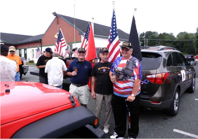
Post members having refreshments and fraternizing prior to parade